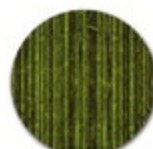
Wood of Bamboo